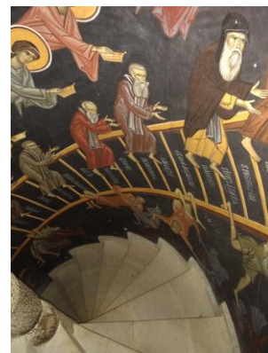
2: Ladder of Divine Ascent, Pângărați Monastery, Moldova