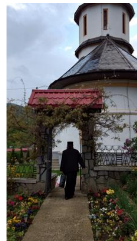
6 Crasna Monastery