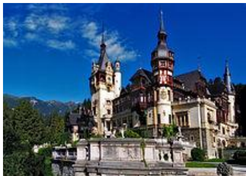
1: Peles Castle, Sinaia