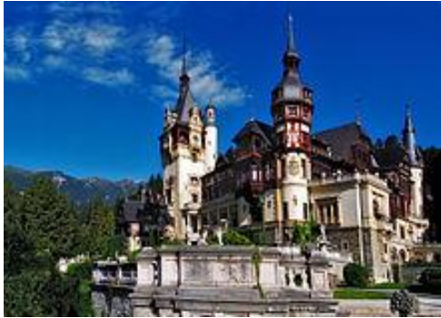
2: Peles Castle, Sinaia