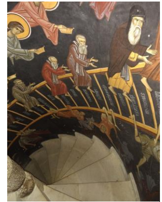
1: Ladder of Divine Ascent, Pangarati Monastery, Moldova