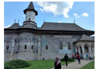
3: The Painted Monasteries, Bucovina